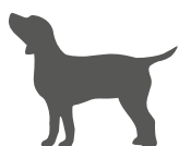
COMPLETE PET FOOD FOR ADULT DOGS OF EVERY SIZE